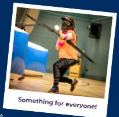
Something for everyone!