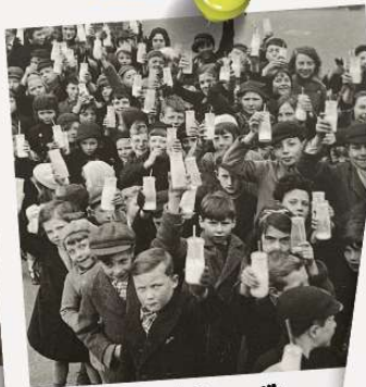
1933 free milk for school children