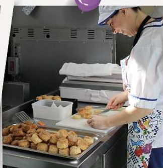
2007 'Let's get cooking' programme launched