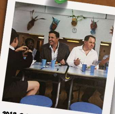
2013 School Food Plan Launched